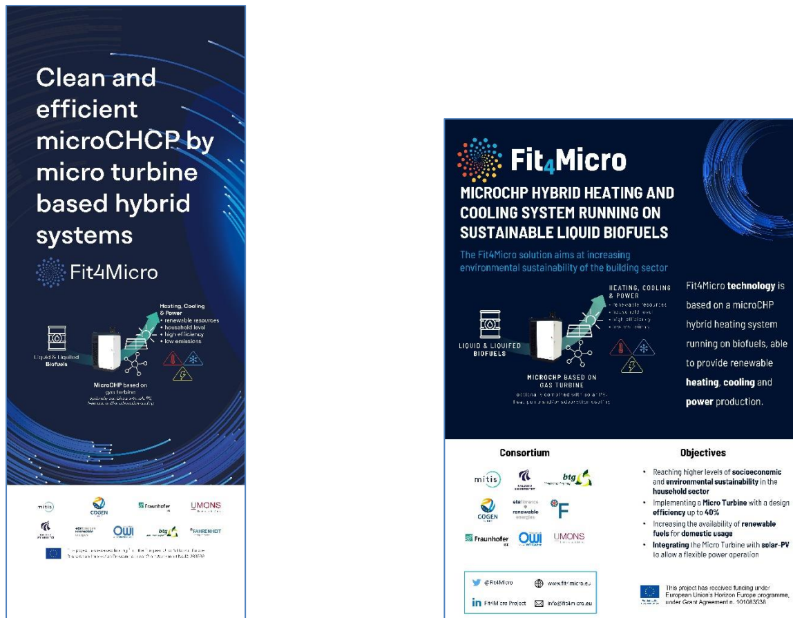
Figure 5. Project roll-up and poster (first version)